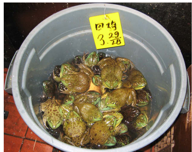
Fig. 1. Live Rana catesbeiana on sale for human consumption from a shop in New York, NY.

The animals were purchased from the shops, killed by the shop owners (we were informed by shop owners in California that the sale of live frogs is illegal in that state, but calls to contacts at the appropriate authorities have been unable to verify this statement) and transported to the laboratory post mortem on ice. We requested each animal be placed in a separate bag for transportation to prevent any contamination that could result from the mixing of blood from one individual to the next. Due to language restrictions, however, there were several occasions where the animals were bagged collectively. To prevent additional cross-contamination of residual DNA, a fresh pair of gloves was used for each frog and equipment was sterilized with ethanol and subsequently flamed between specimens. Each individual was swabbed along the ventral surface and between the digits (i.e. webbing) using Medical Wire and Equipment Company's MW100 dry swab.